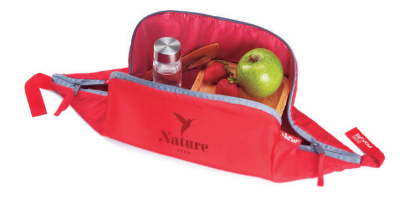
Pantone 567 C